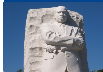
Martin Luther King, Jr. National Memorial